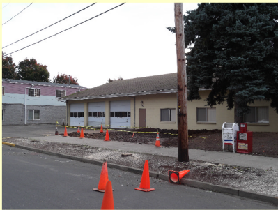
Future site of Veterans Memorial

Raised lettering with the phrases "Memory, Honor and Respect" will curve around the monument and Bronze Plaques will be engraved with names of local veterans in honor of their service to our County.