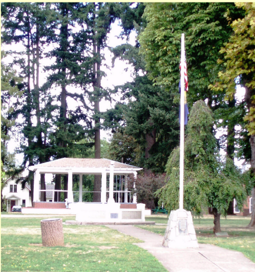
EXISTING MEMORIAL TO BE MOVED

The memorial, as proposed, will be one of the most significant veteran memorial projects in the area and will provide a visible presence of appreciation to those men and women who have served our country in the armed forces.