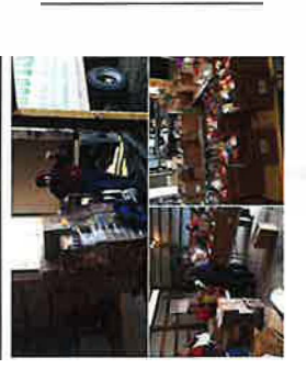
volunteers preparing food YCAP delivery truck and boxes.

designated "essential service" during the Covid 19 Pandemic in the Spring of 2020. Many community normal number of families within our community. volunteers stepped up to help serve double the The Dayton Community Food Pantry became a Thank you, volunteers!